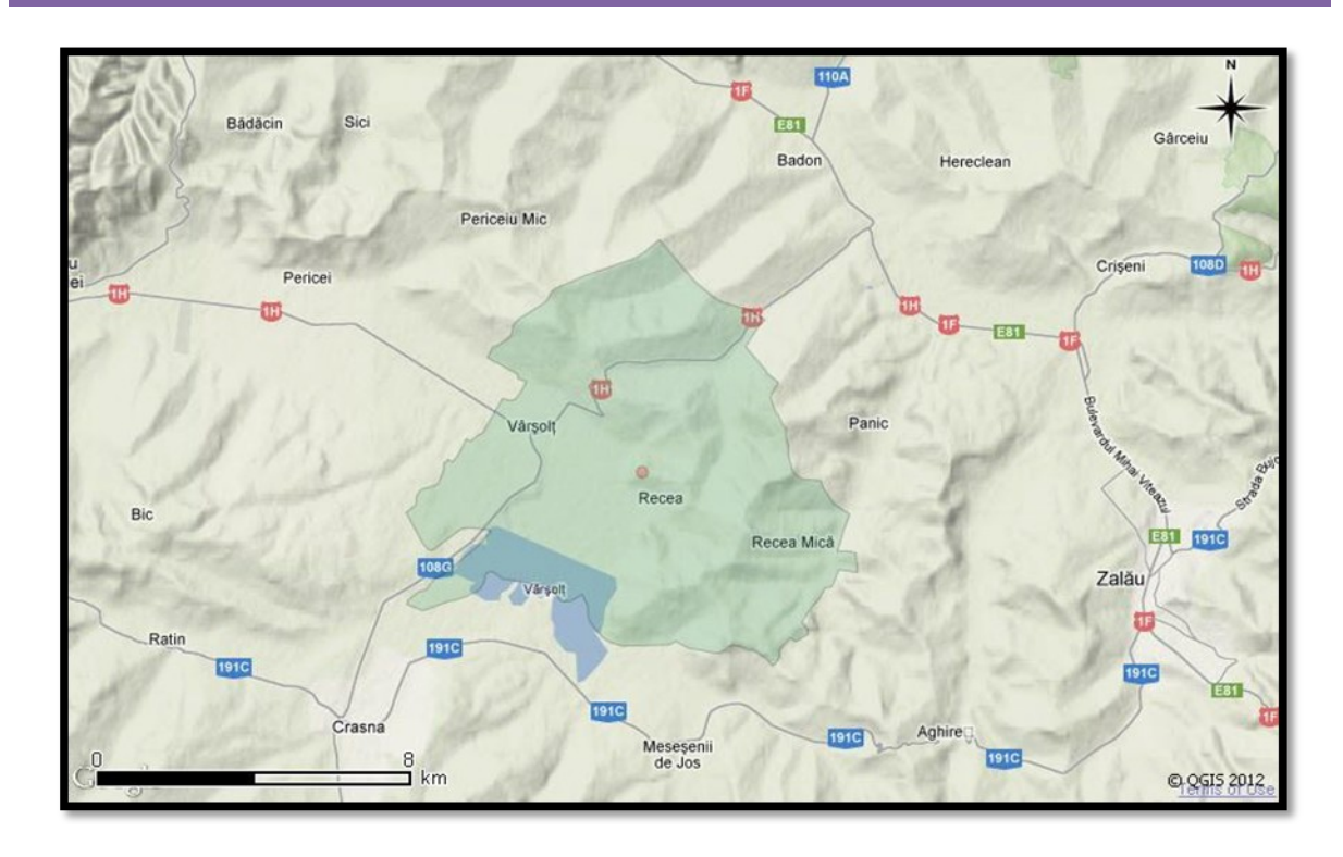
Fig1. Commune of Vârşolţ